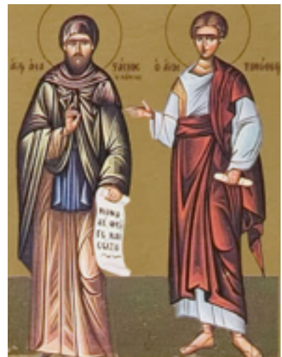
The Holy Apostle Timothy

○ martyr Anastasius, achieving a splendid victory over falsehood, you received a twofold crown for your ascetic struggle and your steadfast contest, and your opposition, even unto death. And Christ the Master has given you the ability to work miracles, as is meet.