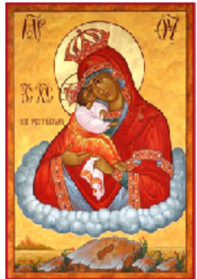
Miracle of the Pochaiv Icon of the Mother of God against the Invaders (1675)

O Holy Tabernacle, when Gabriel called out to you: * Rejoice, O Virgin, full of grace, * the Lord of All became incarnate of you, * as the righteous David had foretold. * In bearing your Creator, you have shown yourself to surpass the vastness of the heavens. * We, therefore, cry out: Glory to Him Who dwelt in you! * Glory to Him Who came forth from you! * Glory to Him Who has set us free * through your life-giving birth!