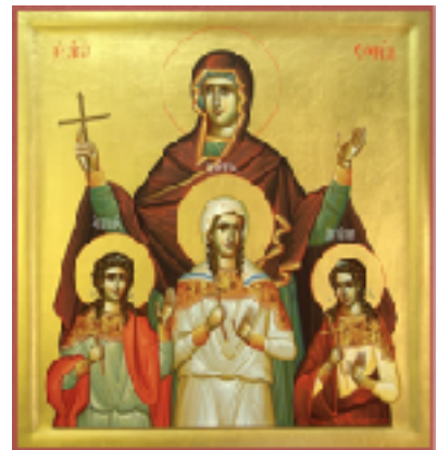
Holy Martyr Sophia, and her three daughters Faith, Hope and Love

The virgin maidens bound together by the law of nature manifestly made stronger by love of the Creator, loosed the bonds of deception with faith! They manfully trampled the enemy and were radiantly adorned with the crown of victory! Now they rejoice, dwelling in the heavenly bridal chamber!