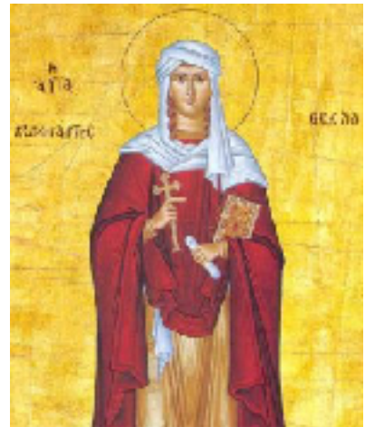
Holy First-Martyr and Equal-to-the-Apostles Thekla

In the struggles of your contest, you trampled the enemy underfoot, most blessed Thekla! As an athlete, you crushed his wiles! You fled from Thamaris and were wedded to your truly beloved Christ. Companion of Paul and fellow-sufferer with Stephen: Since you have boldness, first martyr of Christ among women, deliver our souls from danger, as we celebrate your all-glorious memorial in faith!