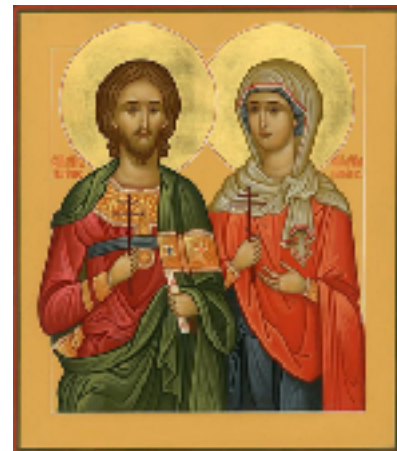
Holy Martyrs Adrian and Natalia

The spouse of Adam caused him to be driven from Paradise through the counsel of the serpent, but Natalia wisely led Adrian to paradise with her holy words! She spurred him on with her teachings to endure painful sufferings! She became a mediator for him of heavenly rewards and unending glory!