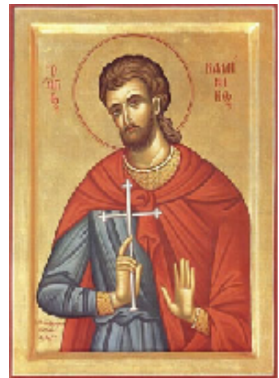
Holy Martyr Callinicus

Let us honour Callinicus in hymns today! He is the foremost fighter for piety; a destroyer of the enemy, the constant companion of the martyrs! He is a temple of the Holy Spirit who became a soldier of Christ the King! He is truly the inexhaustible treasury of healings, and the wonderful support of the faithful!