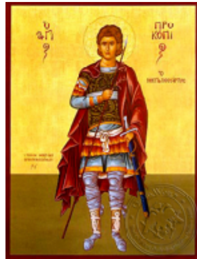
Holy Great-Martyr Procopius

As an invincible commander armed with the Cross, you drowned all the power of the enemy in the streams of your blood! You richly poured forth showers of healing, wondrous one, from the well-springs of salvation, watering all who are held fast in the flame of the passions, divinely inspired one!