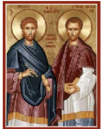
Holy Unmercenaries and Wonderworkers Cosmas and Damian

Your holy tabernacles were light-bearing, saving heavens, and now your relics shine as the sun, radiant with the working of healing miracles, countless as the stars! Blessed Cosmas and most glorious Damian, ministers of the Lord, and intercessors for our souls!