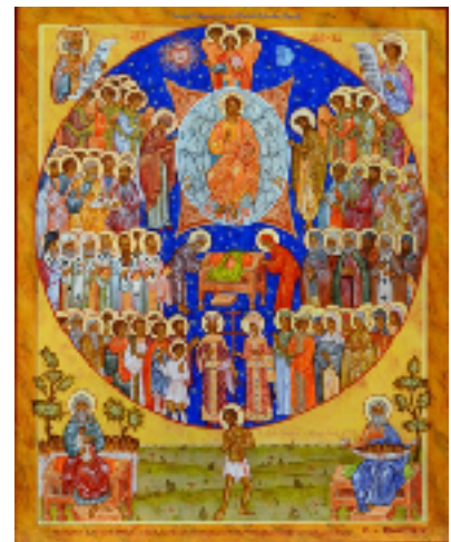
Sunday of All Saints

You are pillars of the Church and the fulfilment of the Gospel, O divine ranks of Martyrs. By your deeds you have fulfilled the words of the Saviour; for through you the gates of Hades, once opened against the Church, have now been closed; and through the shedding of your blood you dried up the sacrifices poured out for the idols. And having built up the faith of believers through your martyrdom, you filled the heavenly spirits with admiration. You stand before Christ, wearing your crowns; intercede with Him for our souls.