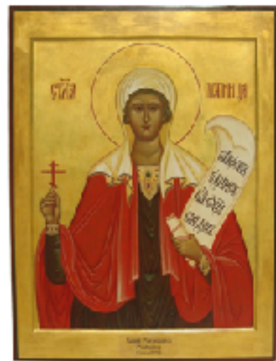
Holy Martyr Parasceve of Iconium

The Queen stood at the right and of the Saviour, as David sang; and your soul, adorned as with vesture of gold, you set before your Lord as a sacrifice, and you offered Him the blood of your body like incense of sweet savour. O all-praised martyr Parasceva, pray for us to Christ God, the Master of all, that He save our souls.