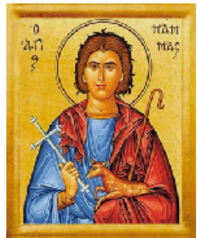
Holy Martyr Mamas

As the son of those who travelled the way of the Lord, you became a new shoot of the olive tree at the Lord's table! For the Lord blessed you through martyrdom and you behold the good things of Zion on high! You ever delight in divine joy with your parents, marvellous Mamas! By your prayers make us partakers of this joy with them!