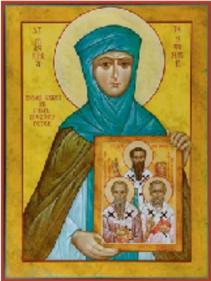
St. Macrina with her brothers Sts. Basil, Gregory & Peter

Saint Macrina was born in Cappadocia at the beginning of the fourth century. When Macrina grew up, her parents betrothed her to a certain pious youth, but the bridegroom soon died. Many young men sought marriage with her, but Macrina refused them all, having chosen the life of a virgin and not wanting to be unfaithful to the memory of her dead fiancé. Saint Macrina lived in the home of her parents, helping them fulfill the household tasks as an overseer together with the servants, and she helped with the upbringing of her younger brothers and sisters.