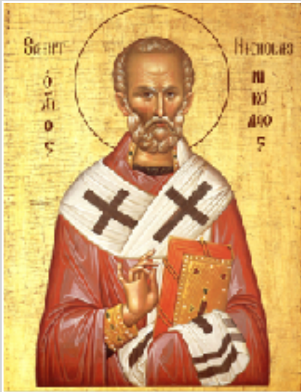
ST. NICHOLAS THE WONDERWORKER СВ. МИКОЛАЯ ЧУДОТВОРЦА