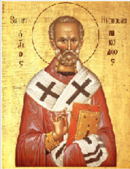
ST. NICHOLAS THE WONDERWORKER —+— СВ. МИКОЛАЯ ЧУДОТВОРЦЯ