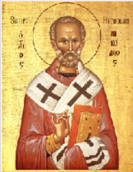
ST. NICHOLAS THE WONDERWORKER СВ. МИКОЛАЯ ЧУДОТВОРЦЯ