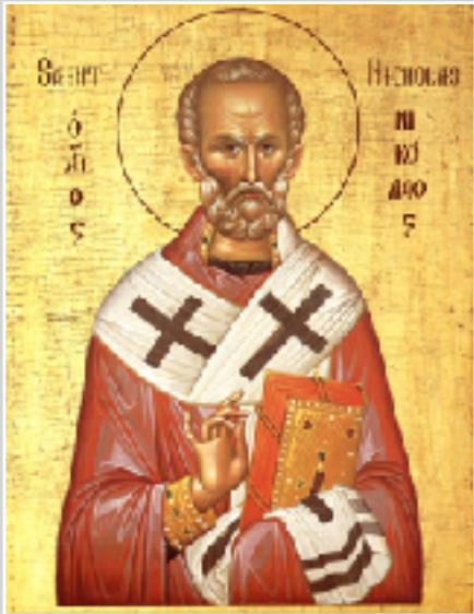
ST. NICHOLAS THE WONDERWORKER СВ. МИКОЛАЯ ЧУДОТВОРЦЯ